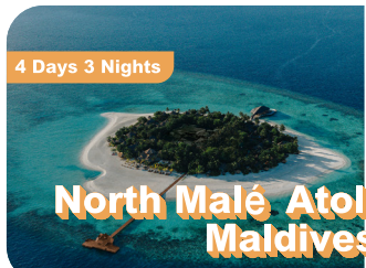
Banyan Tree Vabbinfaru

Discover the mystique of central Vietnam