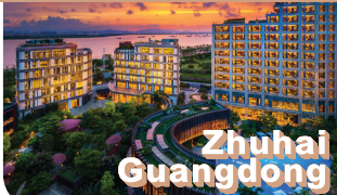
Serensia Woods Hotel

New benchmark for luxury living, exclusive wellness experience