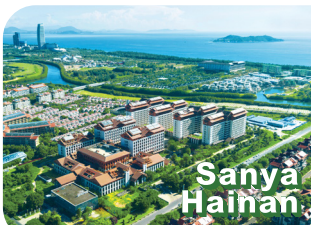
Haitang Bay Health Valley Resort

Hidden secrets paradise with luxurious enjoyment