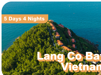
Banyan Tree Lang Co Vietnam

Feel the healing of body, mind and soul among the mountains