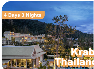
Banyan Tree Krabi

Embrace luxurious comfort in the pearl of the Andaman