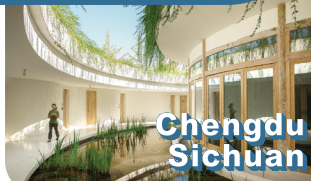
Six Senses Qing Cheng Mountain

Modern interpretation on oriental elegance