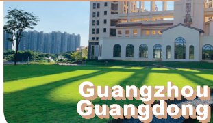
Conghua Sunny Home

New benchmark for luxury living, exclusive wellness experience