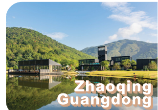
White Swan Resort Green Bay

Surrounded by lychee groves and enjoy natural radon hot springs