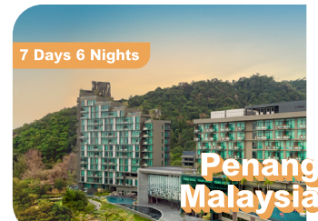
Angsana Teluk Bahang