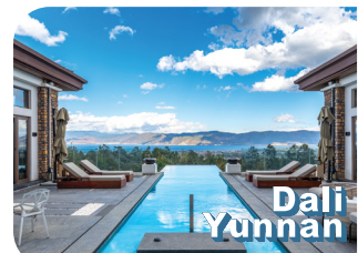
Honor Resort Yun Shu

Surrounded by green mountains, perfect place for retreat