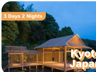
Banyan Tree Higashiyama Kyoto

Serene hilltop sanctuary in Kyoto's Gion and Higashiyama district