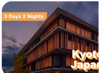
Dusit Thani Kyoto

Serene hilltop sanctuary in Kyoto's Gion and Higashiyama district