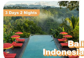
Buahan, a Banyan Tree Escape

Feel the healing of body, mind and soul among the mountains