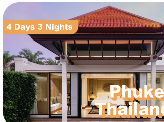
Banyan Tree Phuket

A harmonious journey at the foot of Seorak Mountain