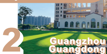
Conghua Sunny Home

New benchmark for luxury living, exclusive wellness experience