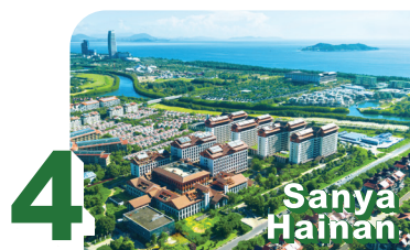
Haitang Bay Health Valley Resort

Hidden secrets paradise with luxurious enjoyment