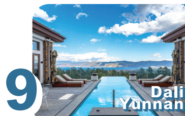
Honor Resort Yun Shu

Surrounded by green mountains, perfect place for retreat