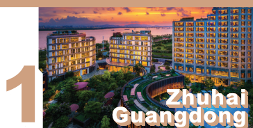
Serensia Woods Hotel

New benchmark for luxury living, exclusive wellness experience