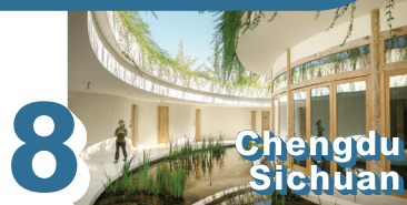
Six Senses Qing Cheng Mountain

Modern interpretation on oriental elegance